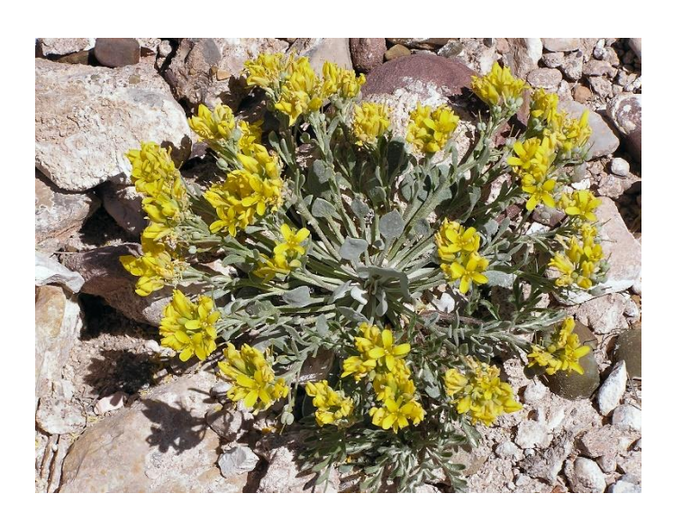
Physaria acutifolia, Sweetwater County

inches long and 2 inches wide. The flowers are yellow, to 0.5 inch long, and scattered along the upper part of the stem. They appear in May and June. The plants occur naturally in dry, open areas in the plains and basins often in clay soils. They prefer full sun and dry soils. They tolerate a variety of soils and are alkaline tolerant. It can be grown from seed covered lightly. Seed is commercially available.