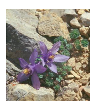
Figure 1. Aquilegia jonesii by B. Heidel

More tools are available to study plant genetics in other model taxa (like Arabidopsis thaliana and some crops like rice and corn), however, due to columbines' exceptional evolutionary history, we have a unique opportunity to use them to answer questions about the genetic basis of plant evolution. They are especially useful for studying traits that appear in this group and not in other model taxa, such as nectar spur petals and extreme alpine adaptation.