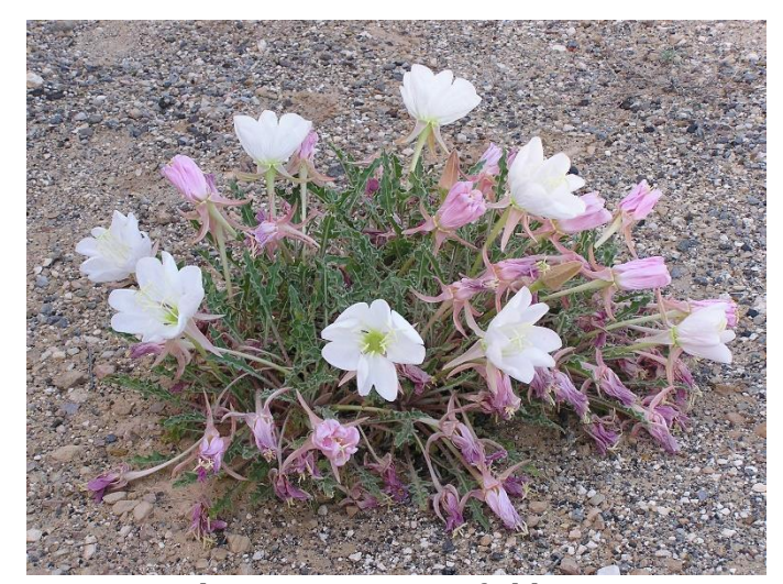
Oenothera cespitosa, Garfield Co., UT

Oenothera cespitosa, Fragrant Eveningprimrose, is a perennial with a deep taproot and is to 8 inches tall and 12 inches wide. The leaves are all basal, to 7 inches long and 1.5 inches wide, and form a rosette. The flowers are white and then fade to a deep pink, to 4 inches across, and borne singly from the basal rosette of leaves with many flowers per plant. They open in the evening and wilt by the middle of the next day. They appear from April to August depending on elevation and variety. The plants occur naturally in dry, open, often barren areas of the plains, basins, valleys, and mountains. They prefer full sun and tolerate many soils. They are alkaline and drought tolerant. It can be grown from mature seed sown as soon as collected. Sow .25 inch deep or less. They are difficult to transplant. It is in the nursery trade.