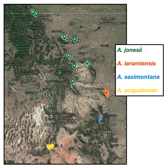
Figure 2. Collection localities from both 2018 & 2019 trips.

Because the WYNPS funded the alpine adapted portion of my research, I will focus on those traits. The most conspicuous of these is Aquilegia jonesii 's tiny vegetative stature (dwarf), while importantly still producing robust flowers and fruits. It also makes waxy leaves and stomata on the upper leaf surface, which are common alpine traits (Köerner 1999). Making stomata on the upper leaf surface is a trait that