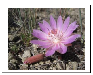
Lewisia rediviva in bloom atop Oregon Buttes, by B. Heidel

Oregon Buttes and the adjoining Whitehorse Creek landscapes are located along the historic Oregon Trail, current wilderness study areas (WSAs) once at the boundary of "Oregon Territory." They were focus of interdisciplinary inventory by Wyoming Natural Diversity Database staff, documenting over 400 native species of plants and animals – from birds, bats, bees and butterflies to small mammals, submerged aquatic insects and vascular plants. You can get all the checklists from the online report (<a href="http://www.uwyo.edu/wyndd/files/docs/reports/wynddreports/19hei02.pdf">http://www.uwyo.edu/wyndd/files/docs/reports/wynddreports/19hei02.pdf</a> ), or the plants through the RM online database.