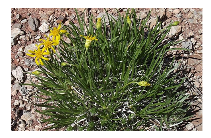
Stenotus armerioides, Platte County

Stenotus armerioides, Thrifty Goldenweed, is a perennial to 10 inches tall forming loose mats to a foot or more across. The leaves are narrow, to 3 inches long, and mostly basal. The ray and disk flowers are yellow, the flower heads to 2 inches across, and solitary at the tip of the many stems. They appear from May to July. The plants occur naturally in dry, open places in the plains, basins, and valleys. They prefer full sun and dry, well drained soils. It is easy to grow from seed.