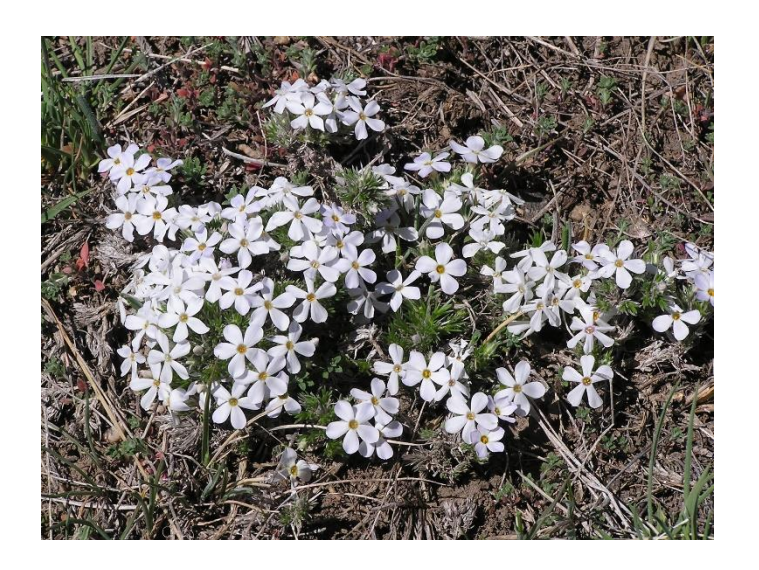
Phlox hoodii, Albany County

Phlox hoodii, Hood Phlox, is a perennial forming small mats to 6 inches across, or rarely to several feet across, and to 3 inches tall. The leaves are small, narrow, and somewhat prickly. The flowers are white to pinkish, to 0.5 inch across, and often nearly cover the entire mat. They appear from April to June. The plants occur naturally in dry, open places of the plains, basins, valleys, and lower mountains. They prefer full sun and dry, well drained soils. It can be grown from seed surface sown outdoors in the fall.