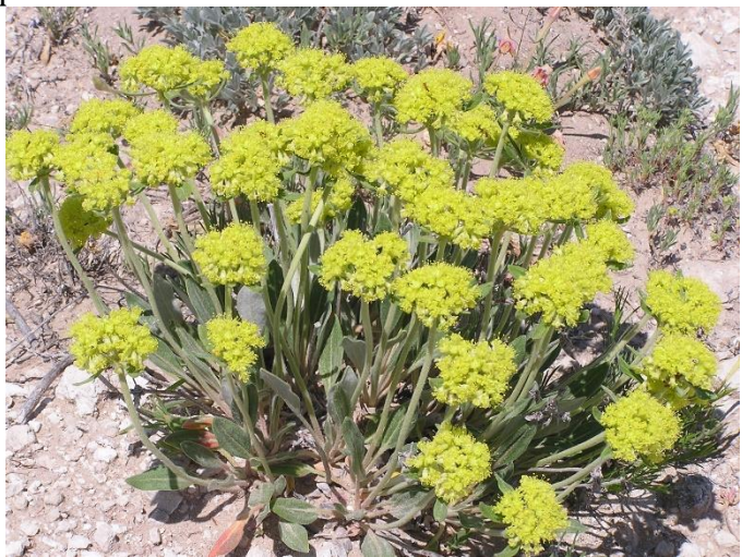
Eriogonum flavum, Goshen County

Eriogonum flavum, Yellow Wild buckwheat, is a tufted perennial to 12 inches tall and wide. The leaves are basal and to 3 inches long. The flower stems are several to many with small yellow flowers in a dense cluster at the tip of each stem. The flowers appear from June to August depending on elevation. The plants occur naturally on dry, open, barren slopes and ridges in the plains, basins, valleys, and mountains. They prefer full sun and dry, rocky, clay soils. It can be grown from seed. Cover lightly for some light exposure.