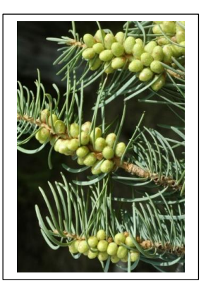
Above: Abies concolor