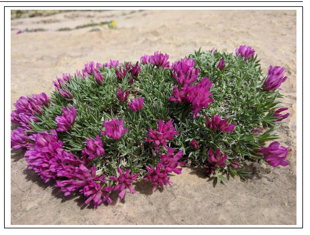
Above: "Laramie Hills clover"