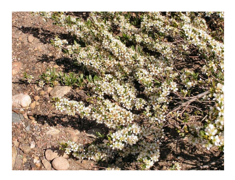
Prunus pumila var. besseyi, Larimer Co., Colorado Cultivated