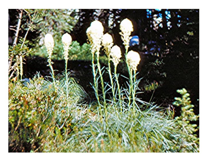
Xerophyllum tenax, Ravalli County, Montana

Xerophyllum tenax, Beargrass, is a perennial forming a large clump to 3 feet wide with stems to 4.5 feet tall. The leaves are mostly basal, very narrow and grasslike, rigid, and to 2 feet long. The flowers are white to cream, each to 0.5 inch across, but borne in a dense club-shaped cluster to 20 inches long and 4 inches across at the tips of the stems. They appear from May to August depending on elevation. The plants occur naturally in open woods and on slopes in the mountains. They prefer full sun to partial shade and dry to moist, loamy, well drained soils in cooler areas. It does not bloom consistently every year. The plants can be grown from seed that has been cold stratified for 90 days or more, or sow outdoors in the fall. Rootstocks can be divided in the fall. Seed is commercially available.