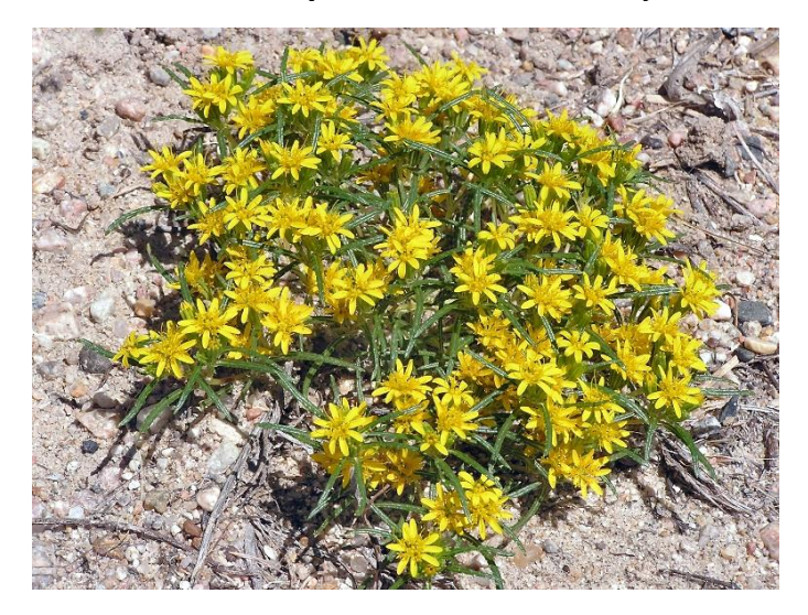
Pectis angustifolia, Goshen County

Pectis angustifolia , Lemonscent, is an annual to 8 inches tall and wide with much branched stems and a lemon scent. The leaves are opposite, narrow, and to 2 inches long. The flowers are in the typical Composite head with yellow ray flowers surrounding a central cluster of yellow disk flowers, the heads to 0.5 inch across and clustered at the stem tips. They appear in August and September. The plants occur naturally in dry sandy or gravelly areas of the plains. They prefer full sun and a dryish, well drained soil. They can be grown from seed which is commercially available.