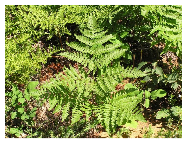
Pteridium aquilinum, Crook County

Pteridium aquilinum , Bracken Fern, is a perennial fern to 6 feet tall. It spreads by creeping rhizomes and can be aggressive forming large colonies. The leaves are triangular in outline, to 6 feet long with the blade and petiole each about half the total length. The young leaves are poisonous. The plants occur naturally in open woods and other openings in the mountains. They tolerate full sun to shade and prefer moist, well drained soils but are drought tolerant. They spread readily so will need to be controlled regularly. They are easily grown from rhizome cuttings and are in the nursery trade.