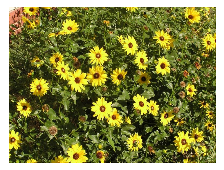
Helianthus petiolaris, Goshen County

Helianthus petiolaris , Prairie Sunflower, is an annual to 4 feet tall and 2.5 feet wide. The leaves are lanceolate or ovate to almost triangular, to 6 inches long and 4 inches wide. The flowers are in a typical sunflower head with yellow ray flowers around a central cluster of mostly brownish disk flowers, the heads to 4 inches across, and at the tips of stems and branches. They appear from June to September. The plants occur naturally in disturbed sites and in loose soils of the plains, basins, and valleys. They prefer loose, well drained soils and full sun. They are easy to grow from seed.