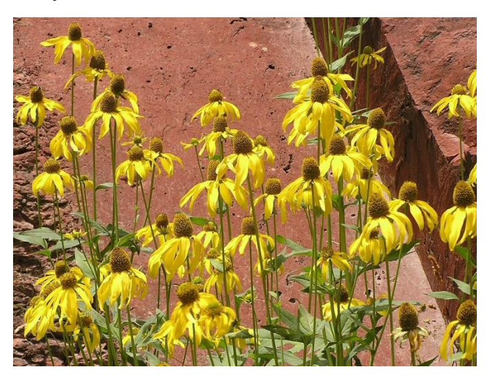
Rudbeckia laciniata, Ouray County, Colorado

Rudbeckia laciniata, Goldenglow, is a perennial to 7 feet tall. The leaves are usually toothed or lobed, to 6 inches long and 4 inches wide. The flowers are in the typical Composite head with yellow reflexed ray flowers surrounding a cluster of yellowish disk flowers which form a short cone. The heads are to 5 inches across at the tips of the stems. They appear from July to September. The plants occur naturally in moist, open or partly shaded areas in the plains, basins, valleys, and foothills. They prefer full sun or partial shade and moist to wet soils. They can be grown from Cold stratification for 30 days will help seed. germination of stored seed. The plants may not bloom until their second year. They can also be transplanted easily.