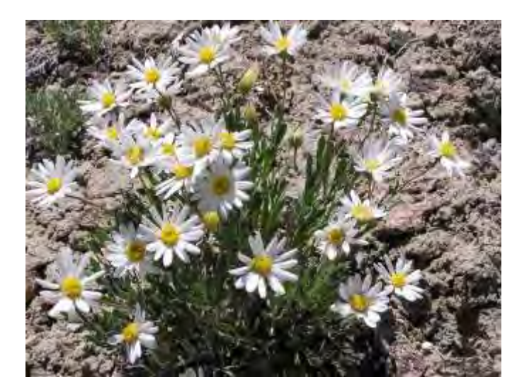
Xylorhiza glabriuscula, Sweetwater County

Yucca glauca, Spanish Bayonet, grows to 3 feet tall and nearly as wide. The leaves are evergreen and sword-shaped with very sharp tips and arranged in a large basal cluster. The flowers are creamy-white or greenish-white, drooping, to 2 inches long, with many arranged on elongate stems overtopping the leaves. They fully open at night and close during the middle of the day and appear from May to July. The plants occur naturally on dry hills and prairies in the plains and basins. They can be grown from seed. Soaking the seed may help germination. Barely cover with soil to allow some light exposure. Stored seed should be cold stratified for 60 days or more before planting. If started in pots, make sure the pots are very deep and transplant when the plant has 2 or 3 grass-like leaves which may take a full year. The plants put most growth into the root system the first 2 years. Keep moist for that time period. It is also in the nursery trade.