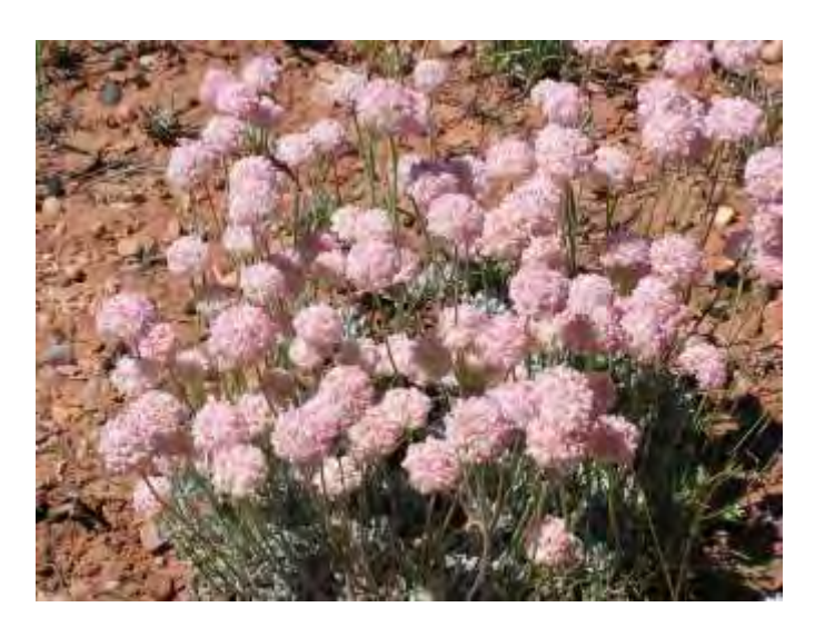
Eriogonum ovalifolium, Kane County, Utah

Eriogonum ovalifolium, Ovalleaf Buckwheat, grows to 8 inches high and often forms mats to 15 inches across. The leaves are basal, short, and spoon shaped. The flowers are borne in a ball-like cluster at the tip of a stem with many stems per plant. Color ranges from white, cream, or yellow to pink or reddish depending on variety. The flowers appear from May to August depending on elevation. The plants occur naturally on hills, slopes, ridges, and open prairies in the basins, valleys, plains and mountains up to alpine slopes. They can be grown from seed lightly covered to allow some light exposure. It is also in the nursery trade.