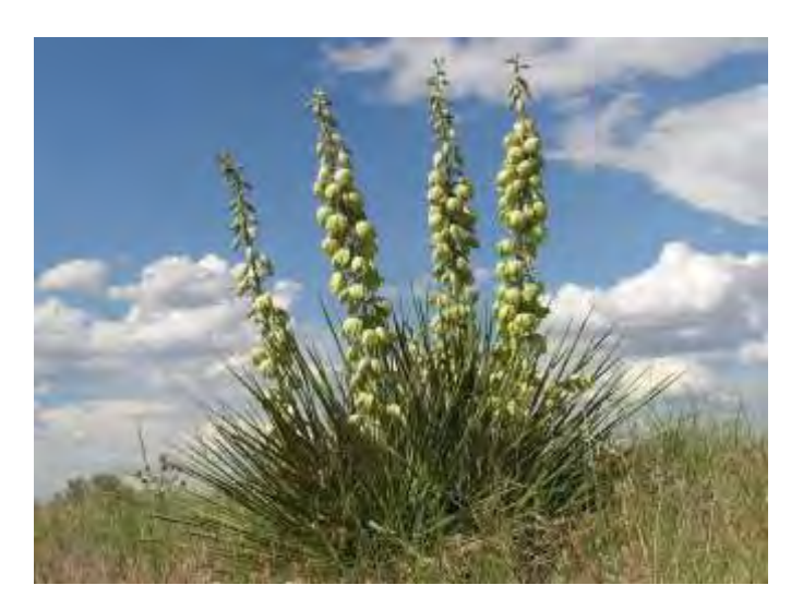
Yucca glauca, Goshen County

Yucca glauca, Spanish Bayonet, grows to 3 feet tall and nearly as wide. The leaves are evergreen and sword-shaped with very sharp tips and arranged in a large basal cluster. The flowers are creamy-white or greenish-white, drooping, to 2 inches long, with many arranged on elongate stems overtopping the leaves. They fully open at night and close during the middle of the day and appear from May to July. The plants occur naturally on dry hills and prairies in the plains and basins. They can be grown from seed. Soaking the seed may help germination. Barely cover with soil to allow some light exposure. Stored seed should be cold stratified for 60 days or more before planting. If started in pots, make sure the pots are very deep and transplant when the plant has 2 or 3 grass-like leaves which may take a full year. The plants put most growth into the root system the first 2 years. Keep moist for that time period. It is also in the nursery trade.