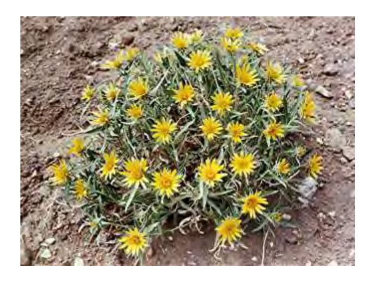
Wyethia scabra, Carbon County, Montana