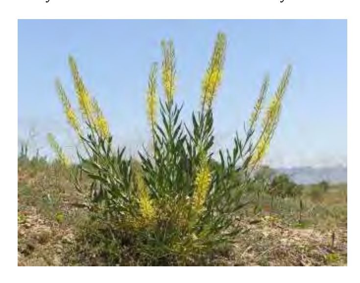
Stanleya pinnata, Mesa County, Colorado

Stanleya pinnata, Desert Princes-plume, grows to 4 feet high and wide with several to many stems per plant. The leaves are to 7 inches long and pinnately compound. The flowers are yellow, to 1 1/4 inches across with yellow stamens often longer then the petals, and scattered along the upper 15 inches of so of the stems in a narrow plume-like inflorescence. They appear from May to July. The plants occur naturally on dry, open hills, often on clay soils or soils containing selenium, in the plains and basins. They can be grown from seed planted about 1/4 inch deep but may take 2 or 3 years to flower. It is also in the nursery trade.