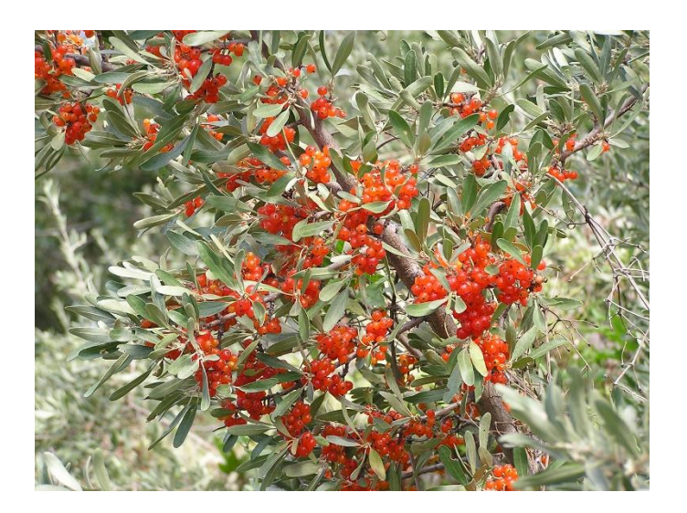
Shepherdia argentea, Platte County

Shepherdia argentea, Silver Buffaloberry, grows to 10 feet high and not quite as wide. It is thorny and spreads from rhizomes forming dense thickets. The leaves are opposite, silvery, narrow, and to 2 inches long. The flowers are inconspicuous, yellowish, and appear before the leaves. They are fragrant and attract many insect pollinators when they appear from April to June. The fruit is a tart, red berry, eaten by birds, and sometimes used to make jelly. Male and female plants are necessary to get berries. It can be pruned to form a small tree. The plants occur naturally along streams and other moist places in the plains, basins, and valleys. They prefer full sun or partial shade and moist soils. They tolerate cold, drought, and moderately alkaline or clayey soils. It can be grown from rhizome cuttings or greenwood cuttings or from seed planted outside in fall or cold stratified for 90 days for spring planting. It is also in the nursery trade including a cultivar with yellow fruit.