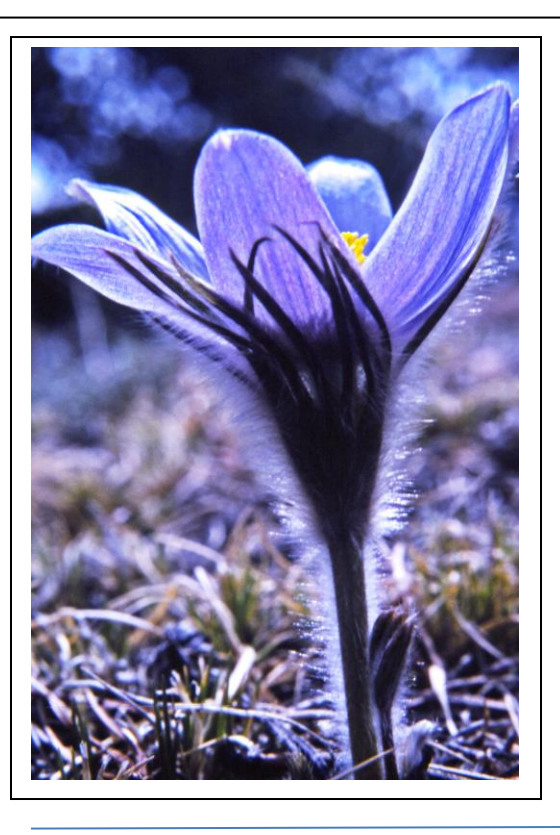
Left: American pasqueflower ( Anemone patens ).

Additional information on pasqueflower is posted on the U.S. Forest Service website, Celebrating Wildflowers: <u>https://www.fs.fed.us/wildflowers/</u> - go to "Plant of the Week" – pasqueflower information is under Pulsatilla patens.