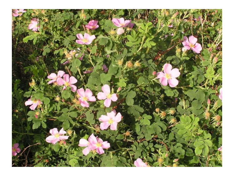
Rosa woodsii, Goshen County

Rubus deliciosus , Rocky Mountain Raspberry, grows to 10 feet high and 8 feet wide often forming a vase shape with long arching branches. The plants are thornless with shallowly lobed leaves to 2 inches long and wide which turn yellow in fall. The flowers are white, to 2.5 inches across, solitary at the tips of short branchlets, but scattered over the entire bush. They appear from May to July and may flower for a month or more. The fruits are red to light purple, to 1 inch across, and eaten by birds. The specific epithet "deliciosus" suggests that they are delicious but they are actually somewhat dry and tasteless. When discovered in 1820, the members of the Long Expedition probably thought they were delicious