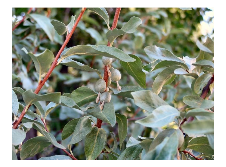
Elaeagnus commutata , Sublette County

Elaeagnus commutata , Silverberry, grows to 6 feet or more high and forms thickets. The leaves are silvery-scurfy and to 3 inches long. The flowers lack petals but have pale yellow sepals to 0.5 inch long and are in clusters of 1 to 3 in the leaf axils. They are fragrant and attract many small insect pollinators. They appear in June and July. The fruits are silvery drupes to 0.5 inch across and are eaten by birds. The plants occur naturally along streams, in swales, and on moist slopes in the mountains, plains, and basins mostly in the western half of the state. They prefer full sun or partial shade and moist soil. They are tolerant of wind, cold, alkaline soils, clay soils, and drought. They may require periodic pruning to control their spread. They can be grown from semiripe stem cuttings treated with rooting hormone or from seed that is cold stratified for 60 to 90 days, then soaked in warm water for 24 hours, and planted in pots that are placed in the dark until seedlings emerge. It is also in the nursery trade.