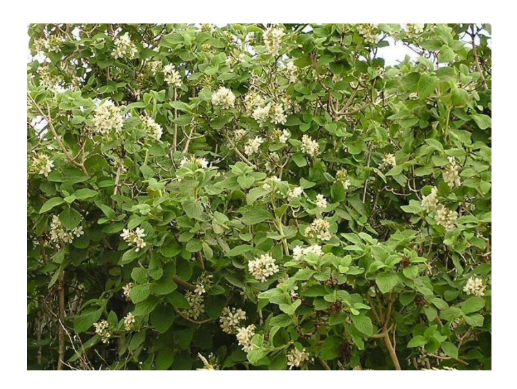
Jamesia americana, Albany County

naturally in our southeast mountains and foothills on open rocky slopes, on cliffs, and in canyons where there is extra runoff. They prefer partial shade and moist, well drained soils but will do well in full sun if kept moist. It can be grown from softwood or greenwood cuttings, from seed that is cold stratified for 30 to 60 days before spring planting, or from seed sown outdoors in fall. It is also in the nursery trade.