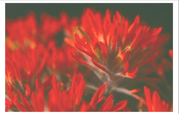
Castilleja angustifolia var. dubia, by Charmaine Delmatier

8:30 am , at the Rock Springs BLM parking lot (north end of town on Hwy 191) Second-day tour-goers can also join at the Red Canyon Overlook on Hwy 28. We will be in hot pursuit of Barneby's clover ( Trifolium barnebyi ) above the Red Canyon Ranch, hear a talk on critical weed control in the area, and look for other endemics