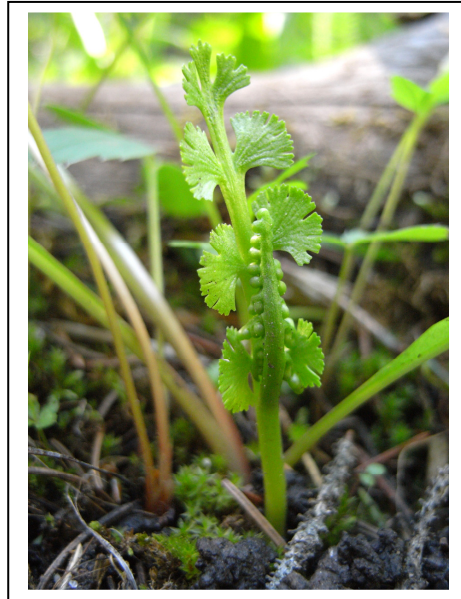
Above: Botrychium crenulatum , by Dave Kesonie

CROOK COUNTY: A vine-like annual legume with no sign of flowers and fruits would have been easy to overlook in a botanical study. As it turns out, Amphicarpaea bracteata was collected with subterranean flowers. It produces flower and fruits late in the growing season. Amphicarpaea is a small genus of East Asia, Africa and the eastern half of North America. Its subterranean fruit is edible and was likely to have been on the menu that first Thanksgiving in 1621 at Plymouth Rock (Ode 2006). In the Black Hills of South Dakota, it is “uncommon at low to mid elevations in moist understory of hardwood drainages” (Larson and Johnson 1999). In the Bear Lodge Mountains, it was found on the terrace, creek bank, and seasonally-flooded stream channel of a steep, wooded valley by J. Larson.