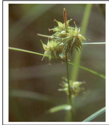
Above: Carex intumescens