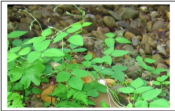
Above: Amphicarpaea bracteata , by Jill Larson

Five native additions to the state flora (Dorn 2001) were documented in 2008 studies. One is from Teton Canyon, in the Caribou-Targhee National Forest, less than 10 miles east of Idaho, discovered in the course of a baseline botanical survey. The others are from the Bear Lodge Mountains, on the Black Hills National Forest, less than 20 miles west of South Dakota, documented in a proposed research natural area. Collection label information will be published as a technical note, and field guide and status information will be in state species abstracts on the WYNDD homepage: www.uwyo.edu/wyndd .